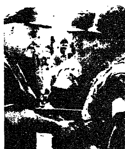
General Creighton Abrams, left, leaves Vietnam after being named Army Chief of Staff.

WASHINGTON (AP). — President Nixon announced on Tuesday that he will nominate Gen. Creighton W. Abrams, now the commander of U.S. forces in Vietnam, to be U.S. Army Chief of Staff.